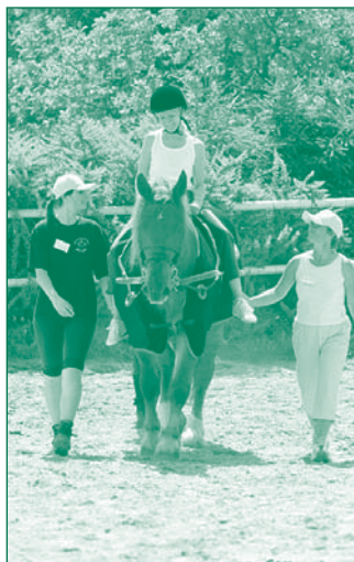
OS Svítani Therapeutic Riding Team