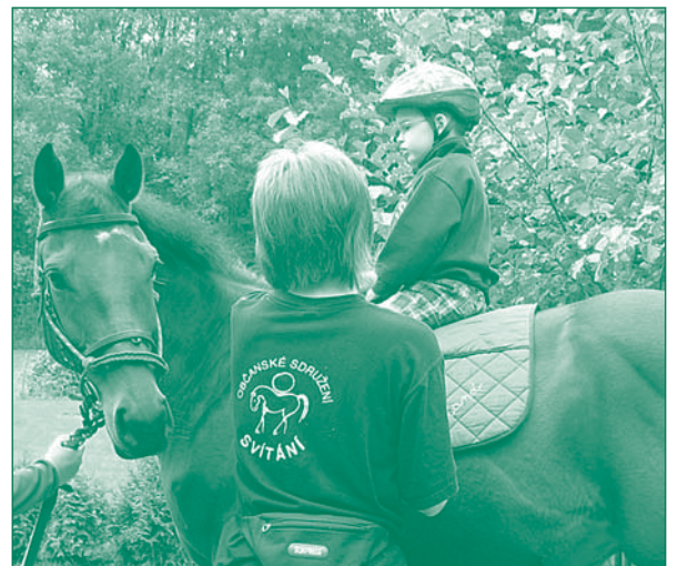
Horse and Rider Taking Instruction