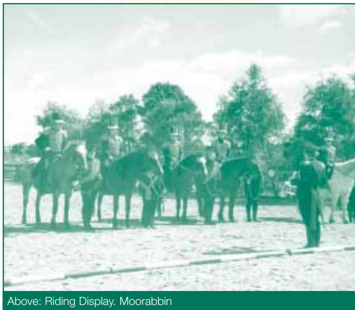
Above: Riding Display. Moorabbin

Two years ago, through correspondence with a rider from an overseas group, it came to our attention that there is an international competition for such displays in England. We sent a video copy of their Military Tattoo effort and received six wonderful rosettes and a letter of congratulations.