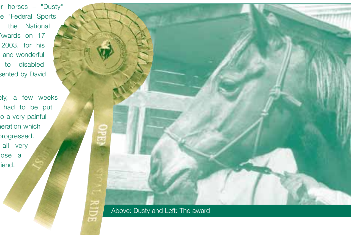
Above: Dusty and Left: The award

Unfortunately, a few weeks ago Dusty had to be put down due to a very painful bone degeneration which suddenly progressed. We were all very sorry to lose a wonderful friend.