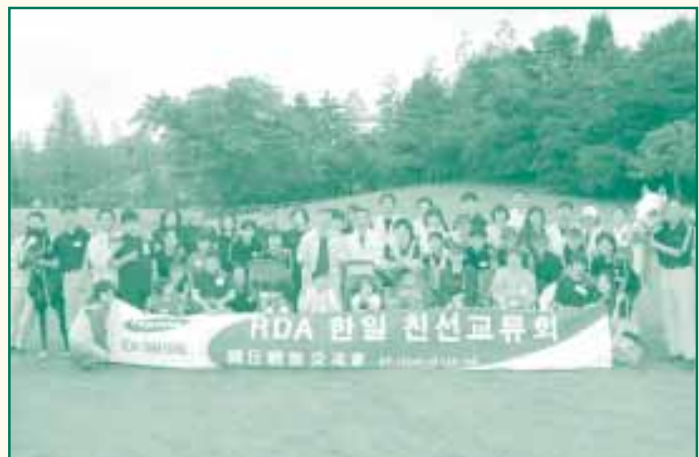
The Riders of Japan and Korea

A heart-warming story of international co-operation. We look forward to hearing of the return visit to Japan. Ed.