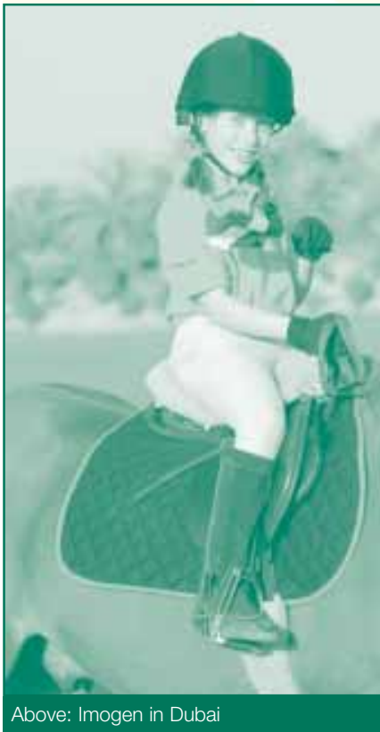
Above: Imogen in Dubai

RDAD teaches about 50 children and young adults each week, maintaining a