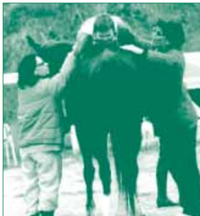
Therapeutic Riding at Serres