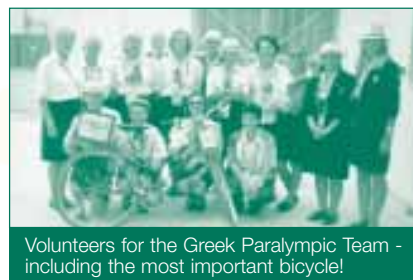
Volunteers for the Greek Paralympic Team - including the most important bicycle!