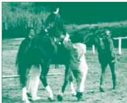
Therapeutic Riding at Serres