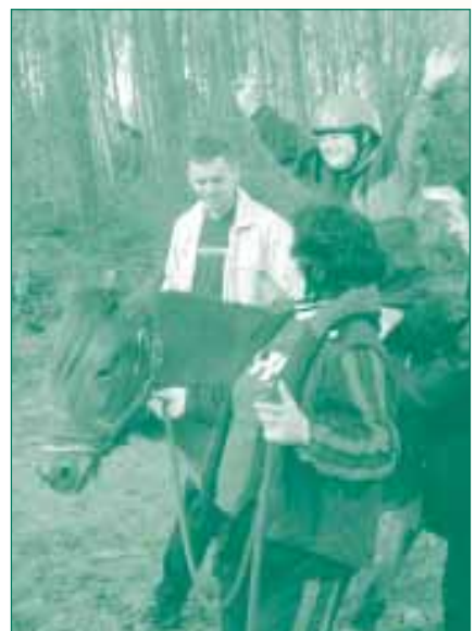
Therapeutic Riding Croatia