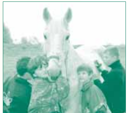
Love - Croatia

Ed. – Congratulations - this is real progress!